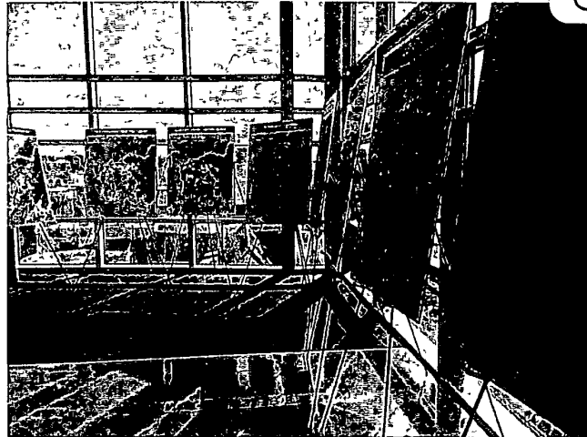
Comprehensive plan maps are on display in the county building today.

By Craig Brown and Kaitlin Gillespie Published: April 14, 2015, 10:08 AM