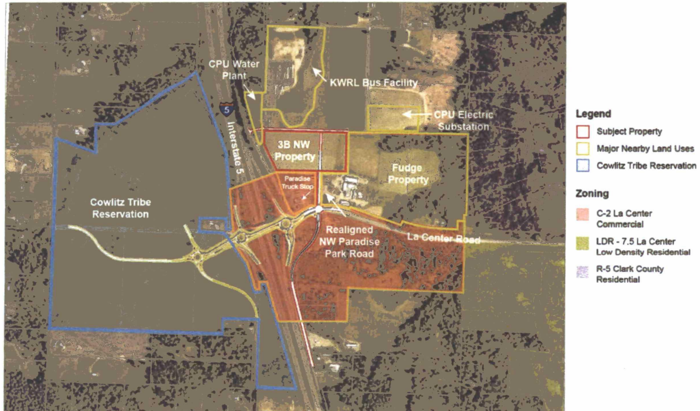
Figure 2 3B NW Property With Key Nearby Land Uses, Zoning and New Interchange Roads

WGS 1984 Web Mercator Auxiliary Sphere Clark County WA GIS http://gis.clark.wa.gov