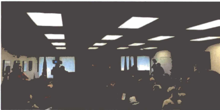
Attempting to testify in front of the Thurston County

You can read the whole story here: https://www.wethegoverned.com/